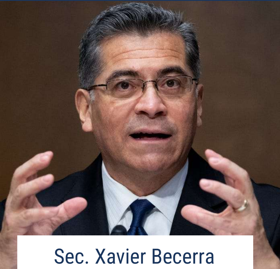
Sec. Xavier Becerra US Dept. of HHS