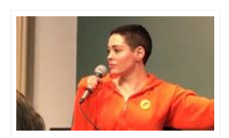
Rose McGowen, Transactivist

I can describe it, but I can't imagine what it is like. I do not experience it myself. Neither does the vast majority of the population — including the army of transactivists and social justice warriors who are pushing him to live as a woman. It is important to emphasize this point. Transactivists rarely suffer gender dysphoria themselves, nor do they represent people with gender dysphoria. Activists represent only activists.